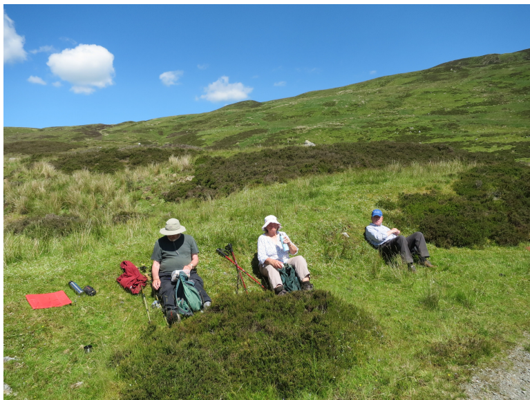
Lunch at the head of the glen – “The sun does not always shine!”