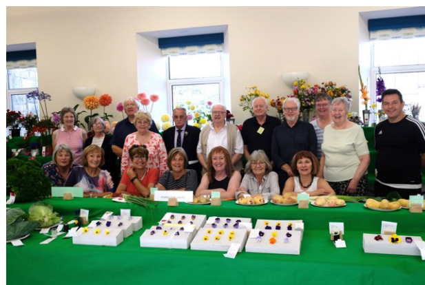
The Committee and Judges