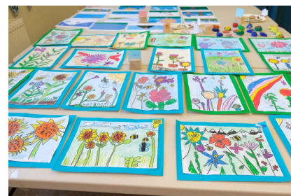
The school drawings entries