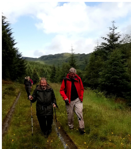
Kirkton Glen Balquhiddier - “It is not always wet!”