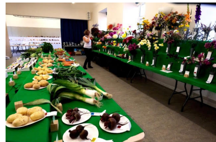
Last minute checking before the Judges come in