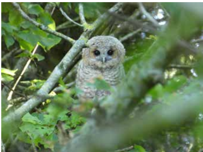
Photograph of this timid Tawny Owl